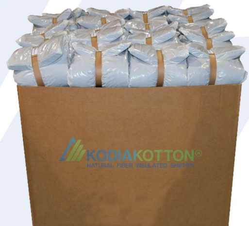
Bulk Bin 40" x 48" x 31" 3 per Pallet