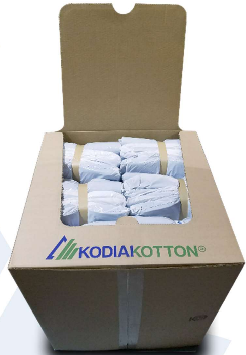
Dispenser Case ~30" x 24" x 24" 12 per pallet